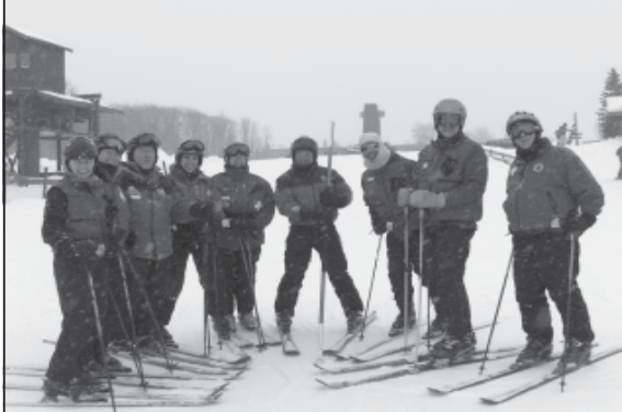
Telemark SES at Indianhead...in the fresh lake laden snow.

2010 Nordic SES Clinic January 9 - 11 -or- January 23 - 25?