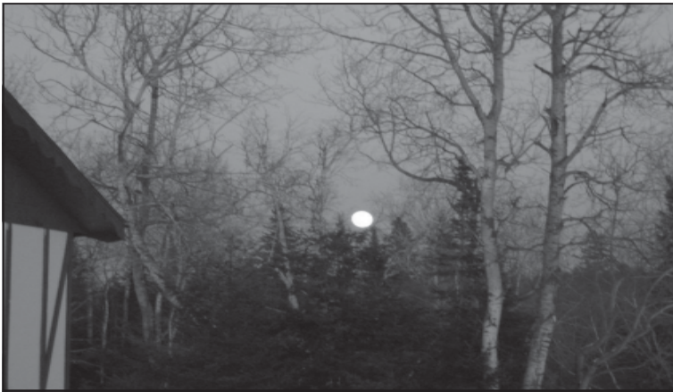
Moon rising over Minocqua Winter Park, host of day one and day two activities.

The dates for next year will be January 9-11 or Jan 23-25, 2010 based on 'YOUR' choices with the results in the next Rusty Parka News.