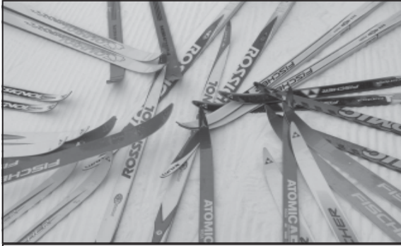
"The Joining of the Skis"- a tradition at the Central Division Nordic SES.