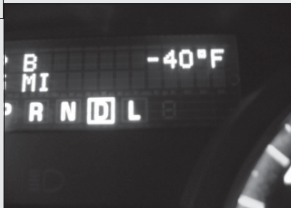
Temp during ride back home. Just in case we forgot it was winter.