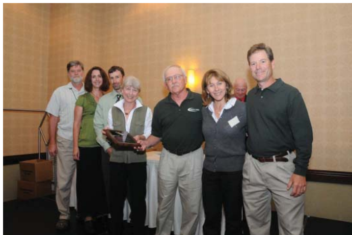
Member of the Blue Mound Nordic stand together after being named Division Outstanding Nordic Patrol.