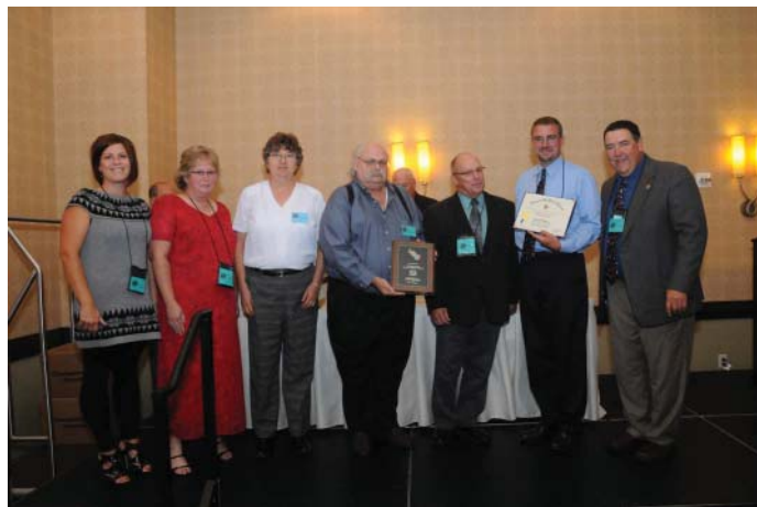
Pando Ski Patrol is awarded the Central Division Outstanding Small Alpine Patrol Award.