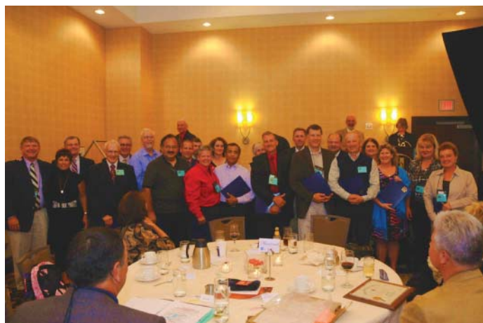
Program award winners pose with Central Division Program Supervisors following presentation of their awards.