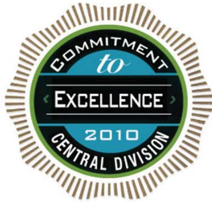
Photo Retro- Spective

Afton Alps Ski