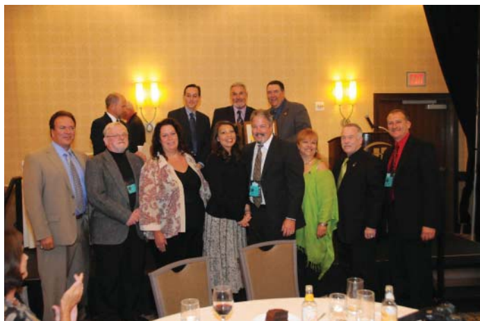
Mt Holly Ski Patrol is named Central Division Outstanding Alpine Ski Patrol. Mt Holly was also named First Runner Up National Outstanding Alpine Patrol.