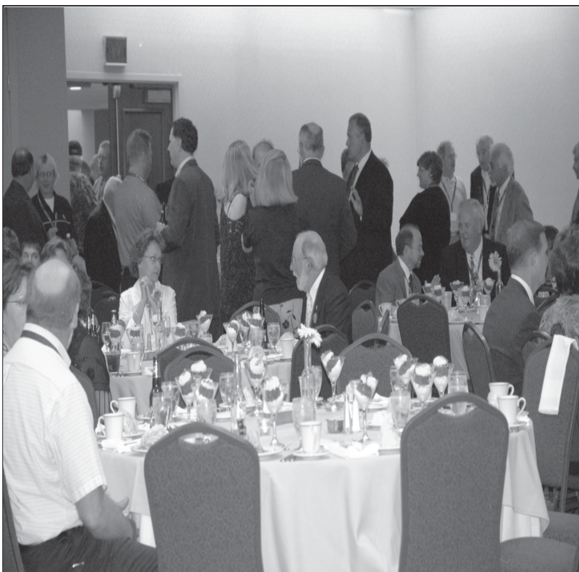
Central Division patrollers and board members enjoy camaraderie at the Awards Banquet during the Central Division 2007 Fall Division meeting in Kalamazoo. Plan now to join the Central Division in Milwaukee September 7 - 9, 2008. Watch future issues of the Rusty Parka News for more information and registration details.