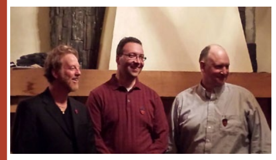
Certified new staff