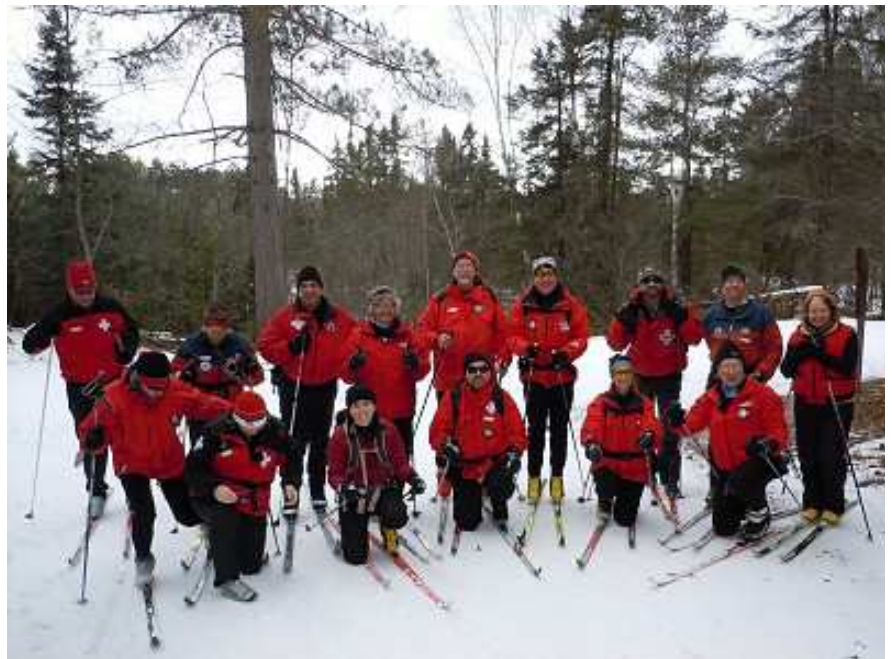
2012 Workshop group photo.

The Minocqua area has lots of good restaurants, which adds to the fun. There are reasonably-priced motels, but we also rent a cabin for the weekend; it has beds for 9, and floor space for more if needed. It's a good weekend -- you'll have a good time, in a beautiful area, and you'll learn to ski better. Come join us!