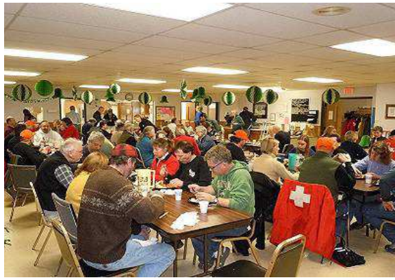
Friday dinner at Senior Center.