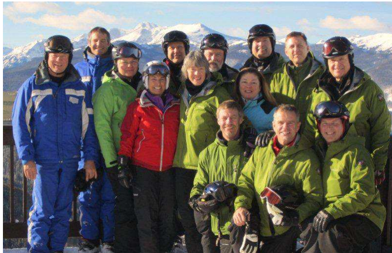
Some of the Division Traveling Gang

Second, we are going to add a new option for the Division STW's, Credentialing Development. These are (2) Full Day sessions for all alpine trainers and patrollers interested in exploring initial or advanced PSIA/AASI certification. Groups will be coached by NSP-C Ski School full certified instructors. The objective of all groups will be to aid interested members in their journey toward initial certification and beyond. If you're serious about pursuing teaching credentials, you'll find these sessions a wise investment of your time. [These are NSP-C SS sanctioned events and not PSIA/AASI CEU's.]