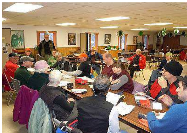
Friday night orientation for new patrol members.

For some 60 Ski Patrollers, it's a job, a tiring slog, a party, and an all-around good time. The race takes place the fourth Saturday in February (2/23 this year). The main race is a 50 kilometer course, or a little more, going in a fairly straight line from Cable to Hayward, in Northeast Wisconsin. Patrollers ski along with the racers, but slower, and not as far: the usual patroller shift is 25k, and we're supposed to average 6k per hour. We ski in pairs, starting at staggered points along the trail. The goal is to have a patrol team pass any given point on the course every 15-20 minutes, so that if there's an injury we'll find them reasonably quickly. Injured skiers are evacuated with snowmobiles. Every year there are a few significant injuries, but most of the evacuations are for exhaustion or cold.