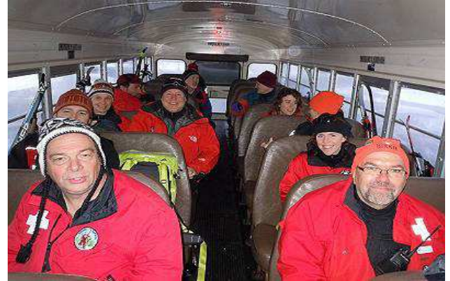
Saturday at 6 AM on way to the race.

The Birkie Patrol is a special-event patrol, so participation is open to all. There's a registration fee, which covers things like rental of the radios. It also covers dinner Friday evening, breakfast Saturday morning, and floor space in the Hayward Middle School Library to sleep on. And showers in the school gym. Of course, some people made motel reservations a year or two ago, or have friends with cabins in the area, but a lot of us stay in the Library. I've noticed, though, that as the years go